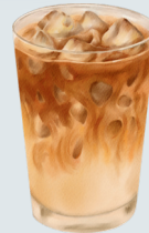
Brown Sugar Shaken Espresso