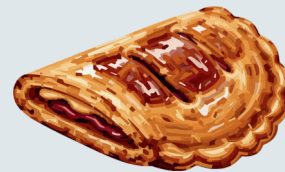
Spinach and Artichoke Calzone